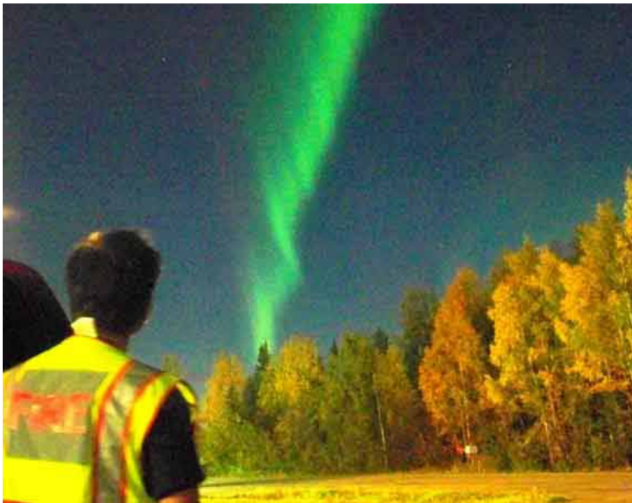
A CGFR Volunteer enjoys the Aurora on a fall evening outside Station 2.

For more information about carbon monoxide and smoke alarms, visit the US Fire Administration website http://www.usfa.dhs.gov/citizens/ .