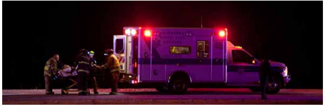
CGFR Volunteers responding to a call.

It can be frustrating and dangerous when driving a fire engine or an ambulance in response to a distress call to encounter a driver on the road who does not know what to do when approached from ahead or behind by an emergency vehicle. It can be equally intimidating for drivers to be approached by an emergency vehicle when they do not understand what to do. Here are some guidelines for what to do when you hear or see an emergency vehicle approaching: