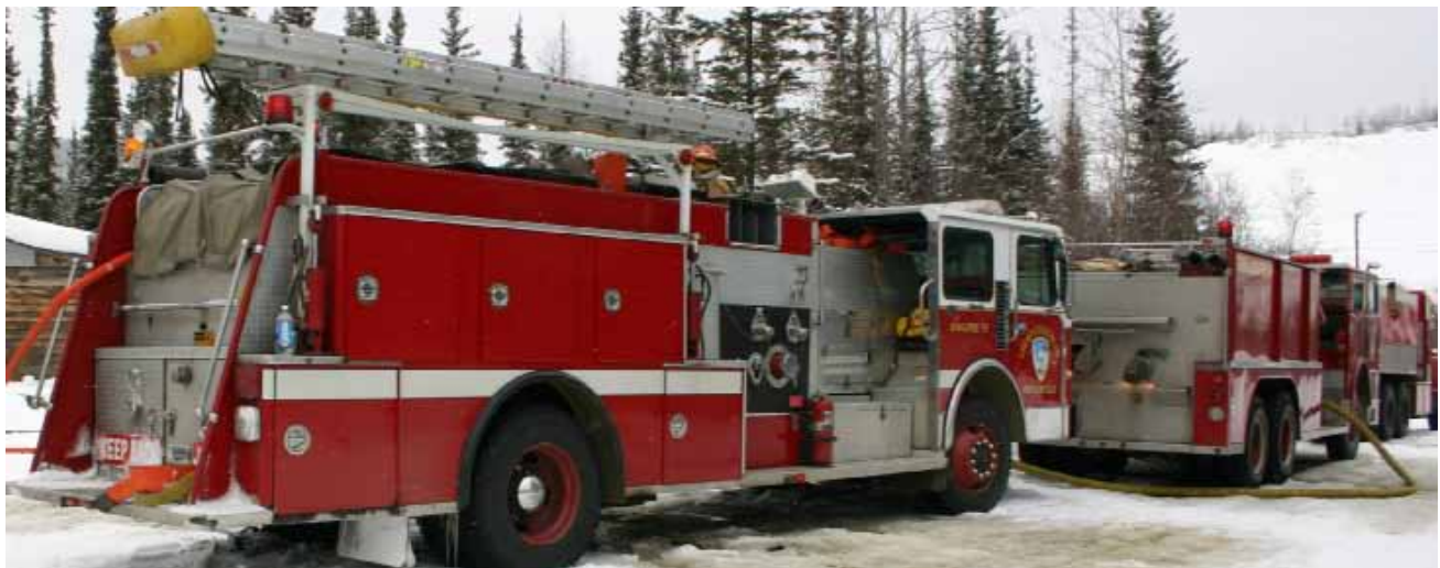
Engine #41 was purchased new in 1987 and fails to meet many current safety standards. In the background is Tanker #45, donated to us by Chugiak Volunteer Fire Department, which has severe mechanical problems.